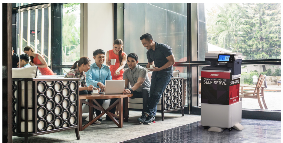
Xerox® VersaLink® C415 Colour Multifunction Printer

A game changer in the print industry, the Workplace Kiosk can be placed in almost any environment. Customers simply scan a QR code on the printer to transform their mobile device into a remote multifunction printer. An intuitive, touchless, hassle-free experience.