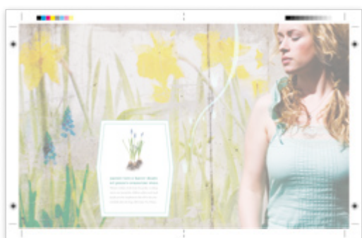
Oversize Output for A3 bleed

The Phaser 7800 colour printer gives graphic arts professionals an impressive range of business-ready finishing options to choose from. Depending on your needs and budget, you can go with the all-in-one Professional Finisher and get stacking, stapling, hole punching, booklet making and v-folding; or start with the Office Finisher LX and get stacking and stapling with the flexibility to add separate hole punching, creasing and stapling capabilities as your workload dictates.